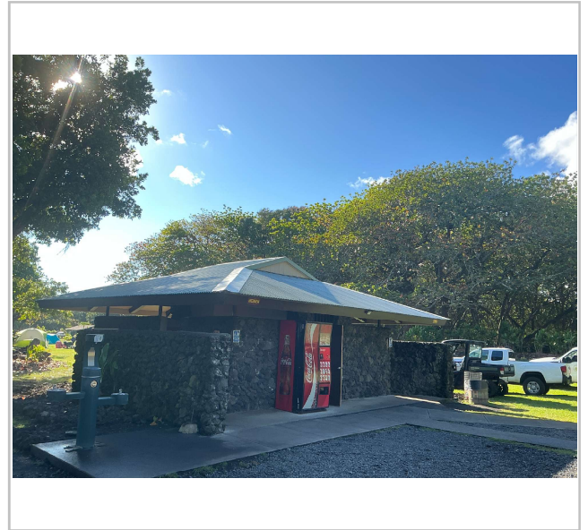
Waianapanapa State Park_Comfort Station Reroof_T&G Roof Decking