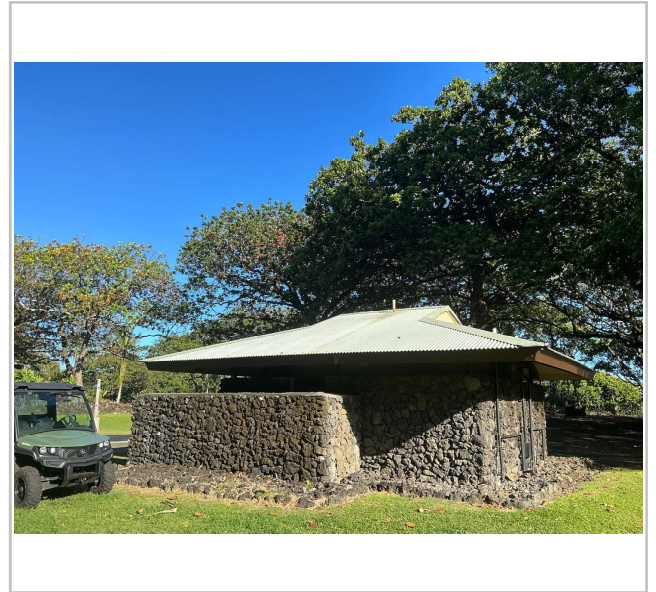
Waianapanapa State Park_Comfort Station Reroof