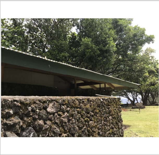
Waianapanapa State Park_Comfort Station Reroof