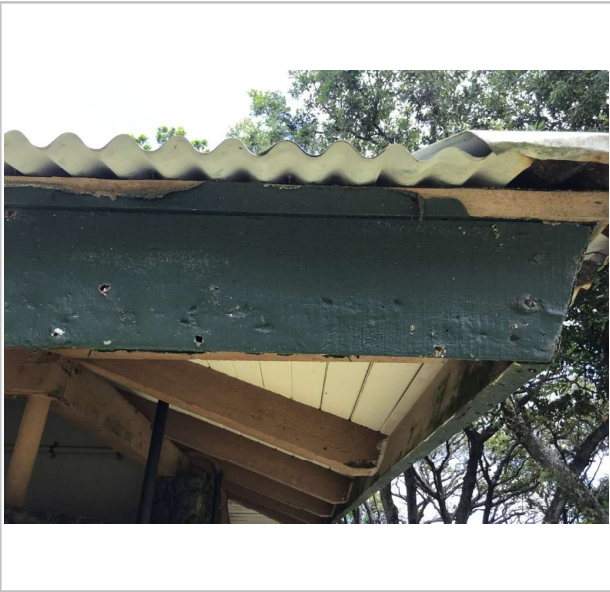
Waianapanapa State Park_Comfort Station Reroof