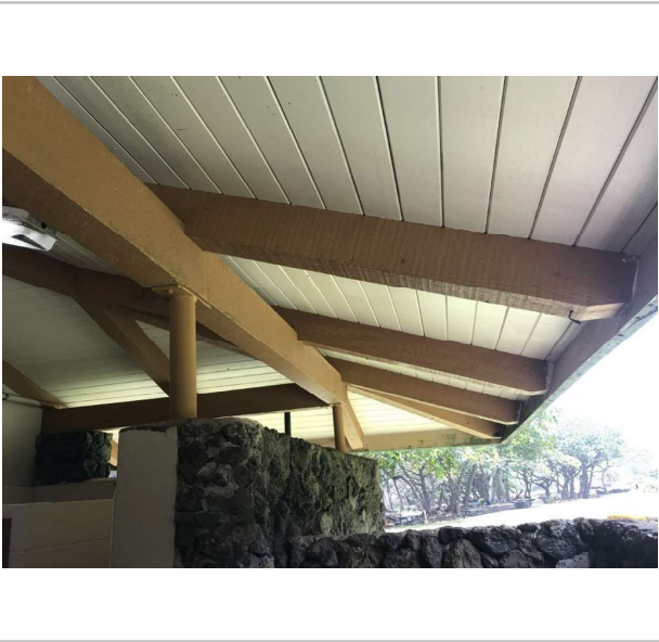
Waianapanapa State Park_Comfort Station Reroof_T&G Roof Decking in poor condition.